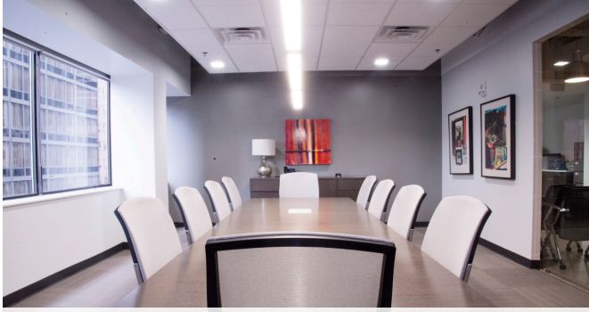
TENANT LOUNGE & CONFERENCE ROOM