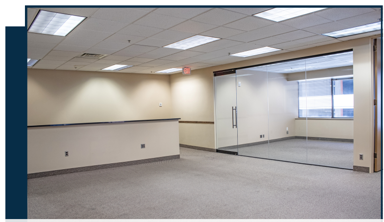
CONFERENCE ROOM & OPEN AREA