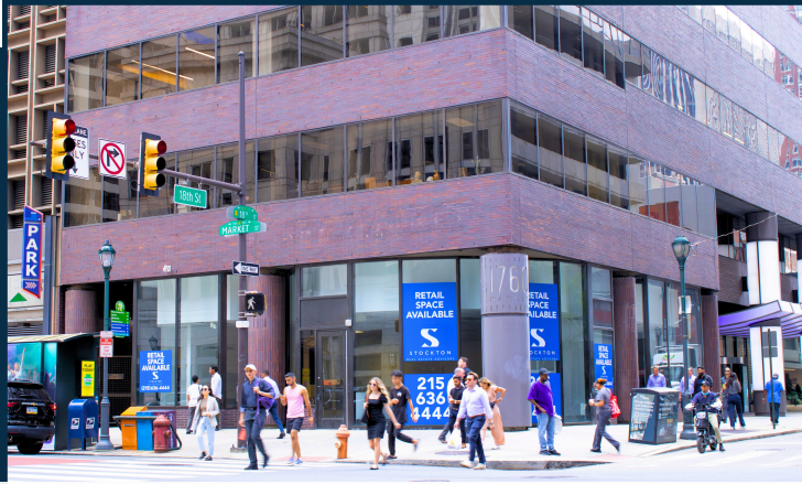
UNPARALLELED VISIBILITY & PRESENCE